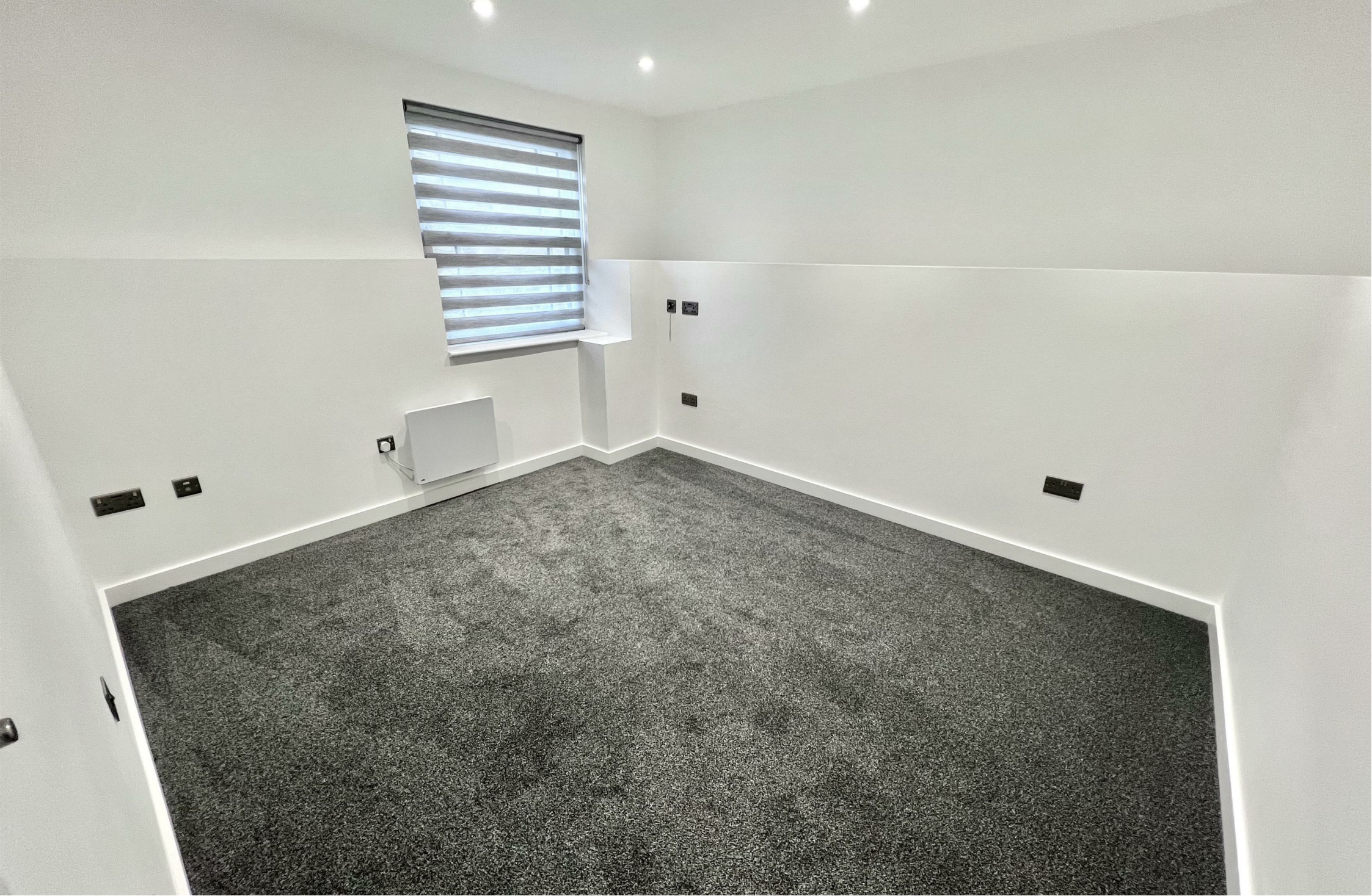
Market Hill, St. Austell, PL25 5QA